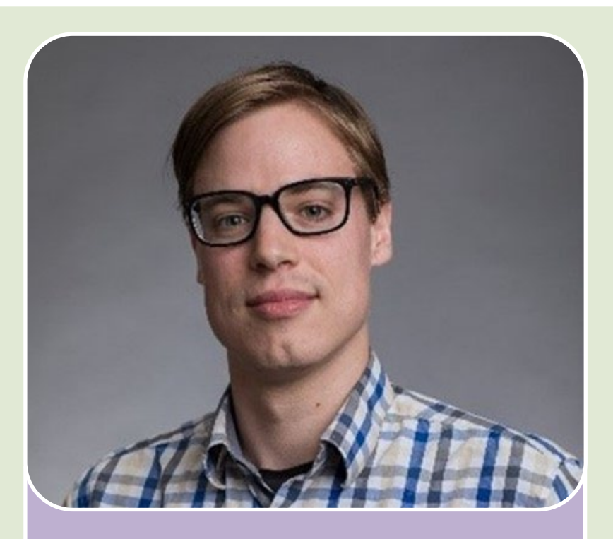
PhD Joined EBMT in 2021 as Statistician for the Nurses Group, Cellular therapy and Immunobiology Working Party (CTIWP) and Pharma related projects. He is currently also Secretary of the Steering Group of the Statistical Committee