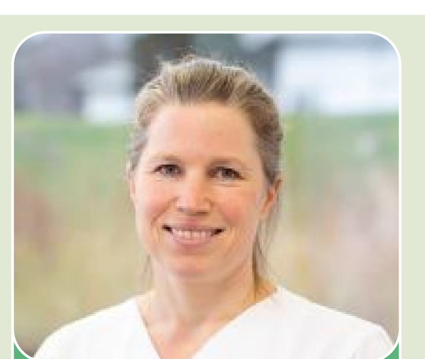
RN, PhD Works clinically as an APN in the alloSCT setting and is also involved in various research projects with special attention to selfmanagement and behavioral support interventions as well as restructuring care delivery. She is part of the NG RC since May