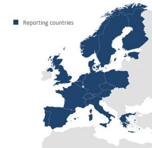
Countries reporting CAR-T cell treated patients to the EBMT Registry

The map below represents a geographical approach in blue of all our reporting countries who are continually submitting data to the EBMT Registry.