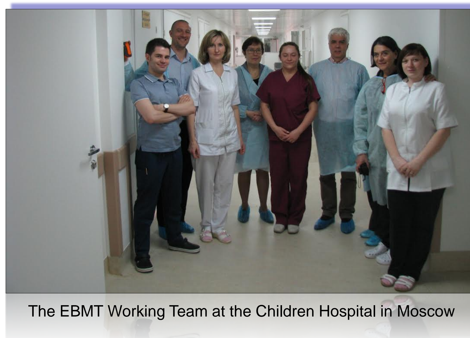
The EBMT Working Team at the Children Hospital in Moscow

It provides an opportunity for doctors and nurses interested in volunteering for activities related to improvement of global access to BMT (Moscow 2012; St. Petersburg and Moscow 2013; China 2016). The aim of these meetings are to strengthen ties between local nurses and young physicians with the EBMT. To share knowledge, care and protocols in newly and more established pediatric BMT programs as well as in adult departments.