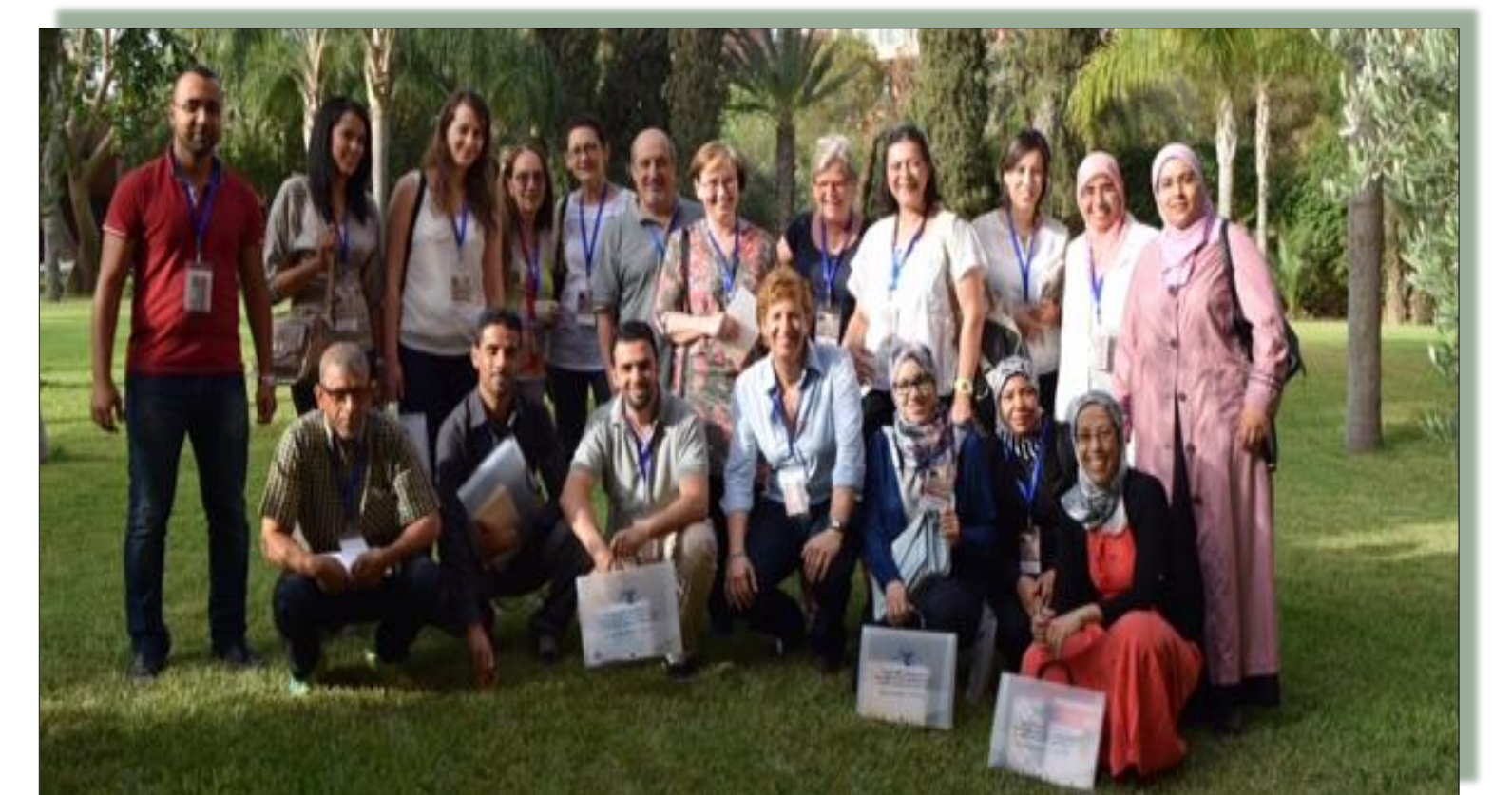
The 5th training course. Marrakesh, Morocco 2015