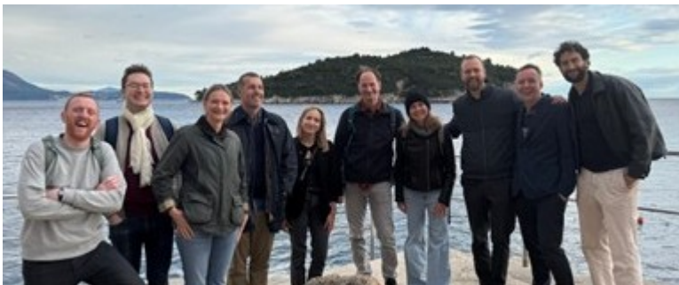
TCWP team, Dubrovnik, Croatia

Continued to build up and consolidate the TCWP team, which will further improve effectiveness and scientific output in the future.