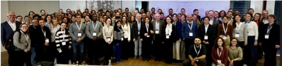
28th Infectious Diseases Working Party Educational Course, November 2025, Würzburg, Germany