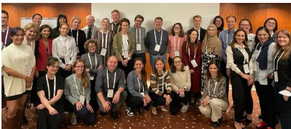
JACIE Inspector Training Course - 17 November 2022 - Castelldefels

The inspections are carried out by the trained, volunteer inspectors who share their professional expertise to inspect against the Clinical, Collection, Processing and Quality Management Standards. Currently, there are approximately 300 inspectors across Europe, Middle East and Latin America. November 2022 saw a return of the Inspector training programme. The training model now includes e-learning modules for the theoretical content with one day workshop focussing on developing the best practice for the inspection itself including pre-inspection preparation and post-inspection reporting.