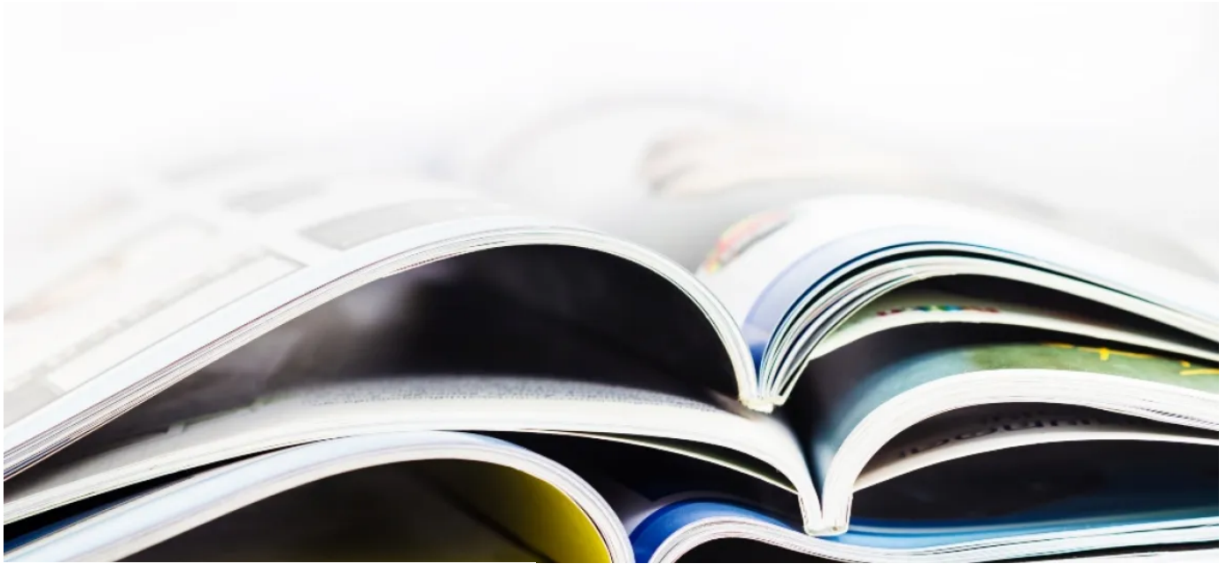
Impact factor (Paediatric Diseases)