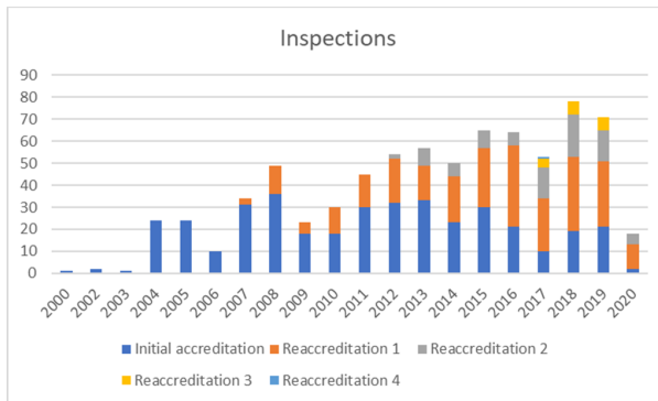
Figure 2 Number of inspections performed per year