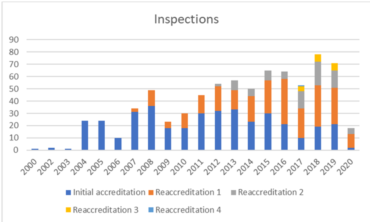
Figure 2 Number of inspections performed per year