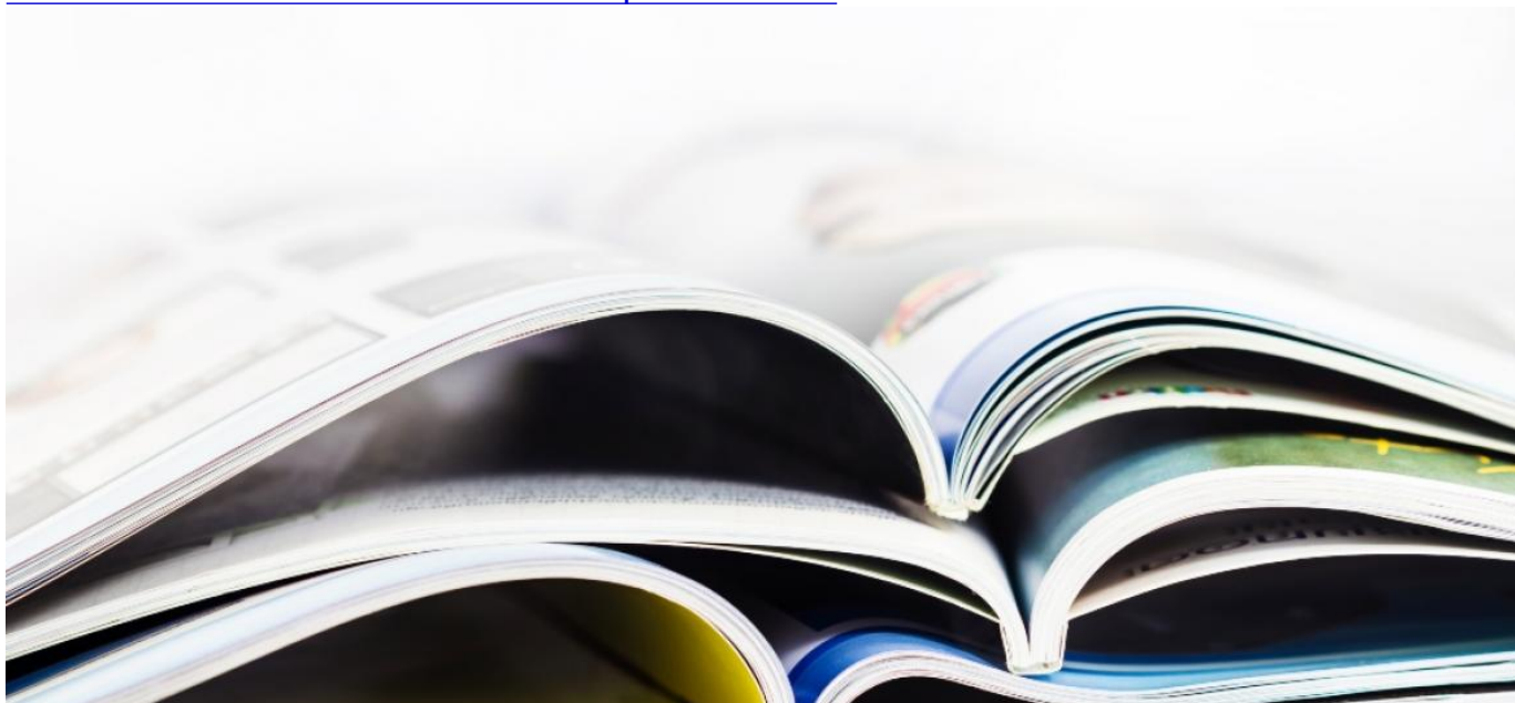
Impact factor (Chronic Malignancies)

See the full list of the CMWP 2020 publications