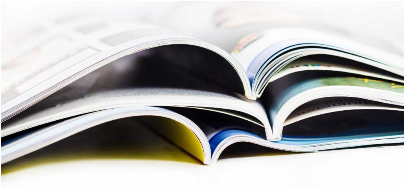
Impact factor (Cell Therapy & Immunobiology)